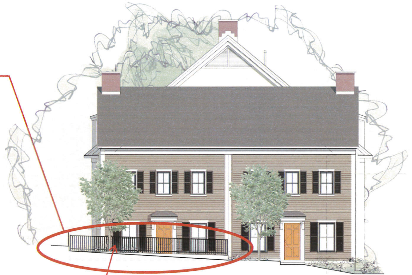
BUILDING A FRONT ELEVATION

PREVIOUSLY APPROVED 42" AMERISTAR IRON FENCE