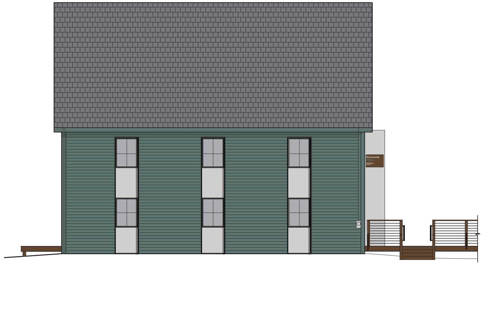
04 EXTERIOR ELEVATION: WEST SCALE 1/8" = 1'-0"