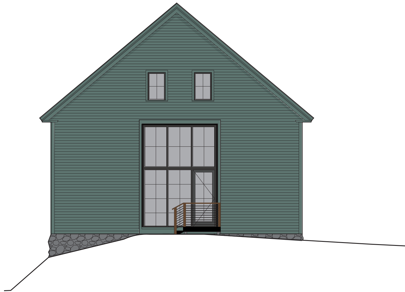
01 EXTERIOR ELEVATION: NORTH SCALE 1/8" = 1'-0"