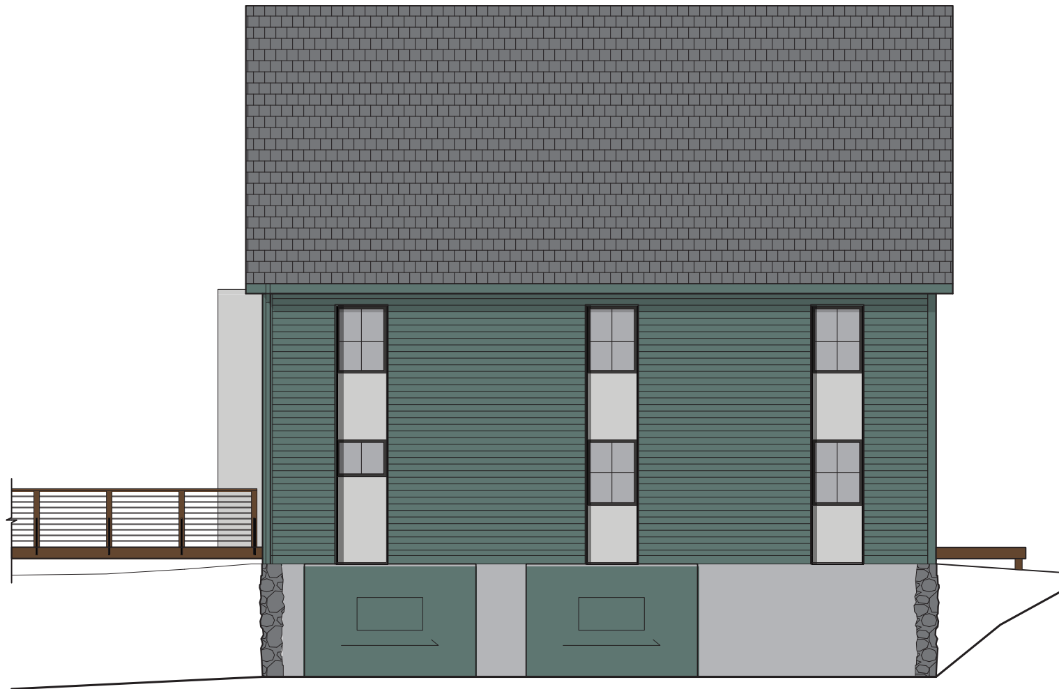
03 EXTERIOR ELEVATION: EAST SCALE 1/8" = 1'-0"