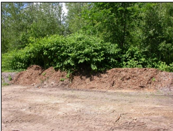
Wood chips containing Japanese knotweed