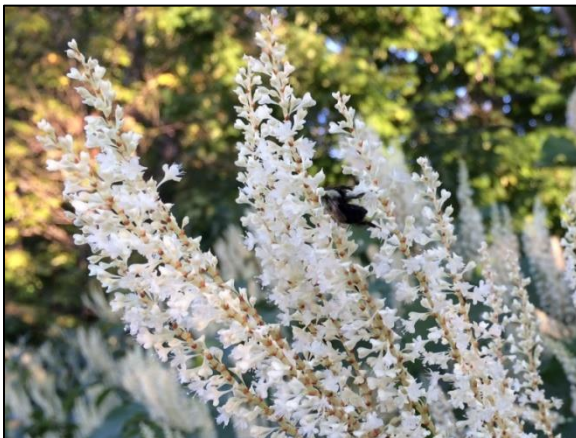
Flowering is arranged in panicles