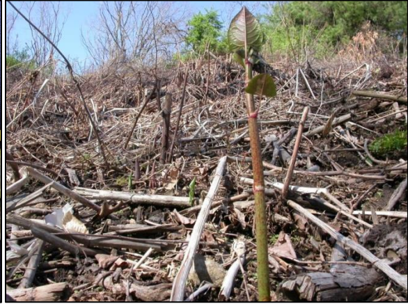
New shoots emerging in the spring-April/May