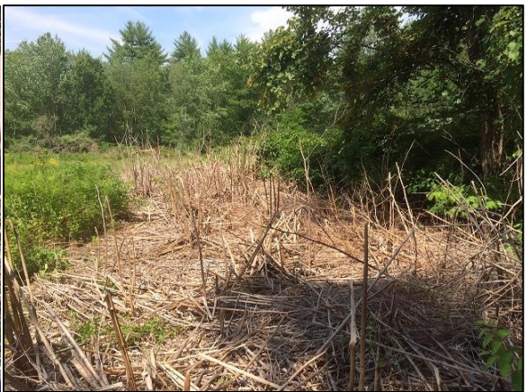
On-going project using herbicide to restore site