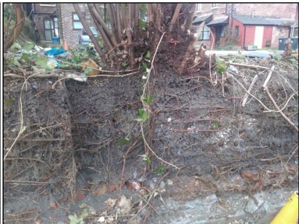
Underground rhizome structure