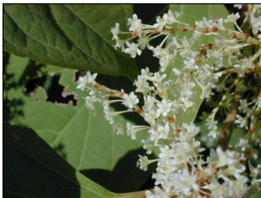
Japanese knotweed flowers