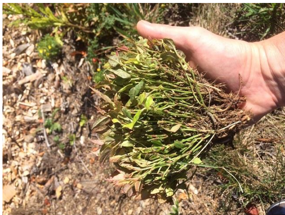
Mutation resulting from insufficient herbicide