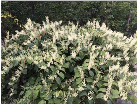
Many small whitish flowers along the stems