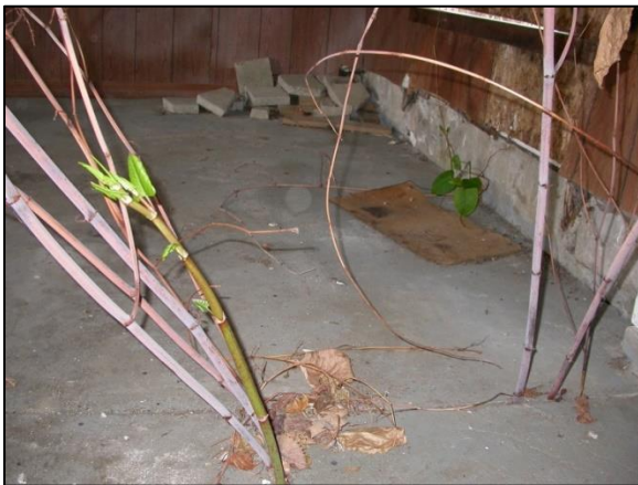
Structural damage to residential home/basement