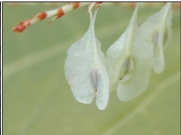
Seeds, 3-wing calyx, develop in the fall