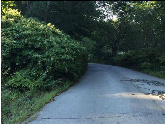
Roadway sight distance and safety issues