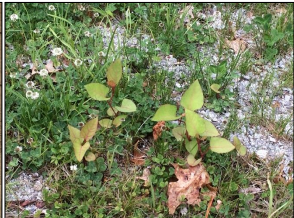
Construction site with regenerated rhizome segments