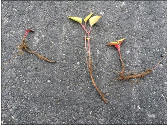
Rhizome segments/fragments that have regenerated