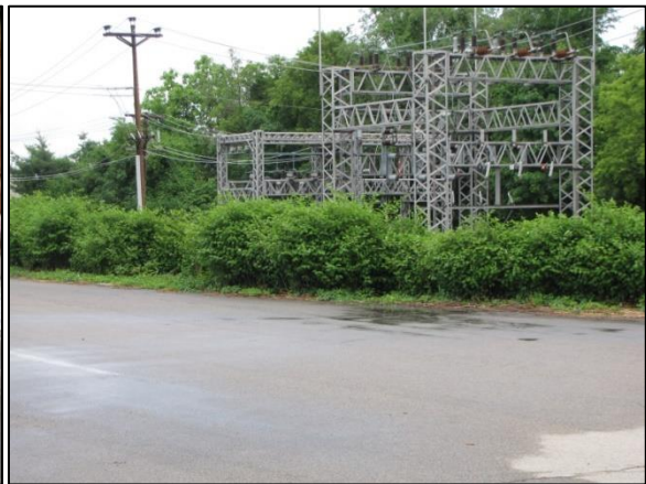
Power grid sub-station impacts