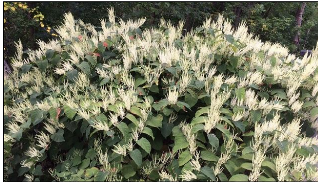
Japanese knotweed in flower

Japanese knotweed is an aggressive invasive plant species that is becoming more widespread in the state of New Hampshire and the northeast. Because it can be spread vegetatively, the probability of moving Japanese knotweed during routine maintenance and in fill material associated with construction activities is increasing across the state, leaving municipalities and landowners with the costs associated with remediation of this destructive weed. Because of this, it is worthwhile to consider how to address Japanese knotweed movement prior to maintenance activities and during the planning phase of construction projects, rather than mitigating the damage post-construction. These BMPs will help you to understand the risks associated with Japanese knotweed; how Japanese knotweed is moved, both naturally and as a part of maintenance and construction activities; identify some basic critical control points to reduce the movement of Japanese knotweed; and provide some Integrated Pest Management (IPM) based control methods for Japanese knotweed.