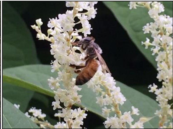
Flowers attract honeybees and other pollinators