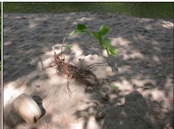
Erosion/scour damage moving rhizomes