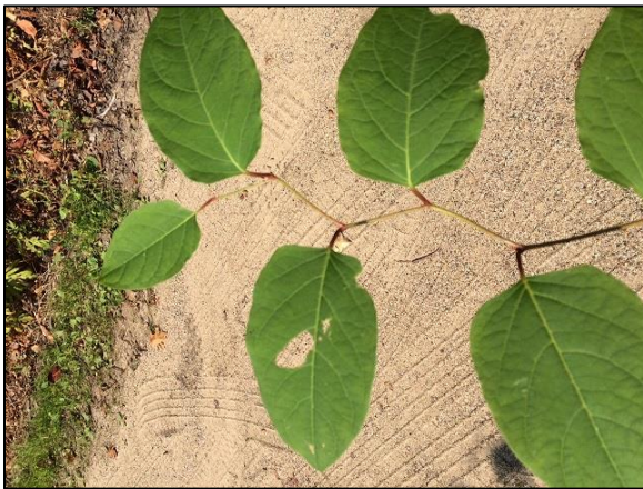
Alternately arranged leaves on zig-zag stem