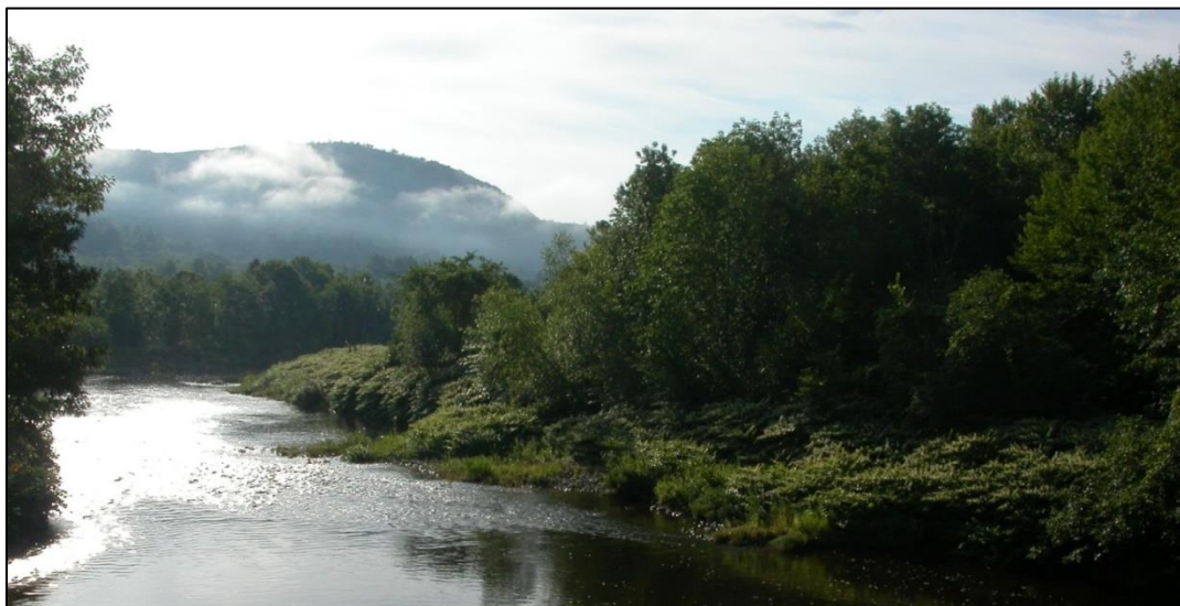
The Baker River in Rumney, NH, just one of the many areas along this resource choked by Japanese knotweed

Japanese knotweed can spread very quickly and forms dense colonies that out-compete native vegetation by blocking sunlight, releasing chemicals (allelopathic) from its rhizome that suppress plant growth and germination, and robbing nutrients and water from the soil. In floodplain and shoreline habitats, knotweed is moved by flowing water during flooding and ice flow events. Whole or partial Japanese knotweed plants are carried downstream and take hold to form new populations. The Baker River is one of New Hampshire’s river systems being choked by knotweed. Increases in Japanese knotweed populations within riverine systems can impede water flow and lead to increased risk of flooding.