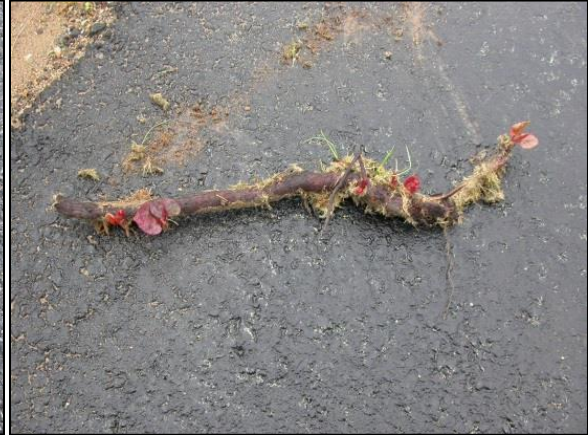
Large segment of rhizome regenerating