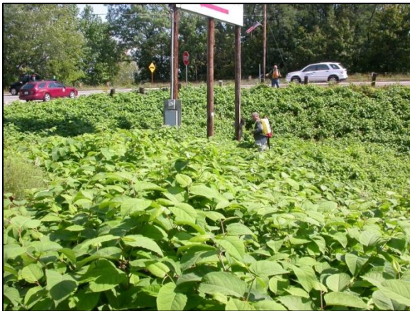
Herbicide treatment after June cutting (Before)