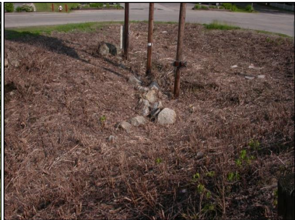
Success of post flowering herbicide treatment (After)