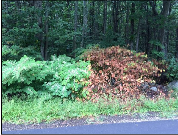
Herbicide effects on right vs untreated on left