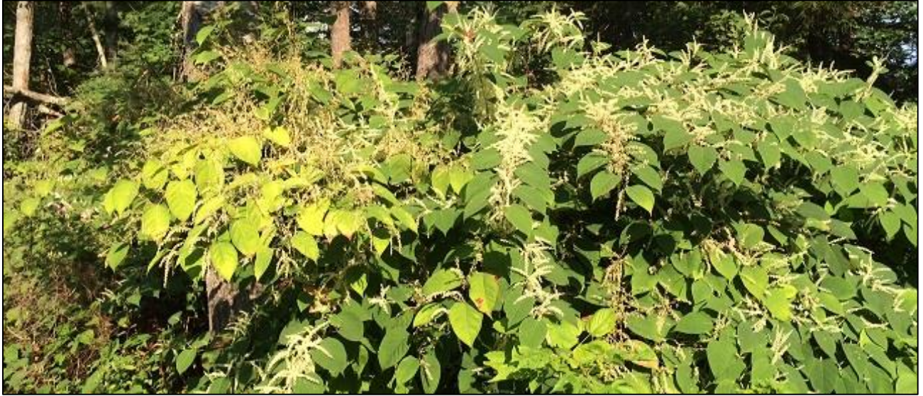
Mature flowering Japanese knotweed cluster