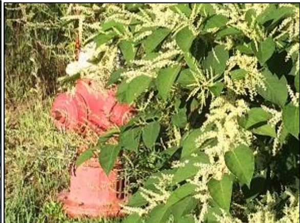
Obstruction of fire hydrant