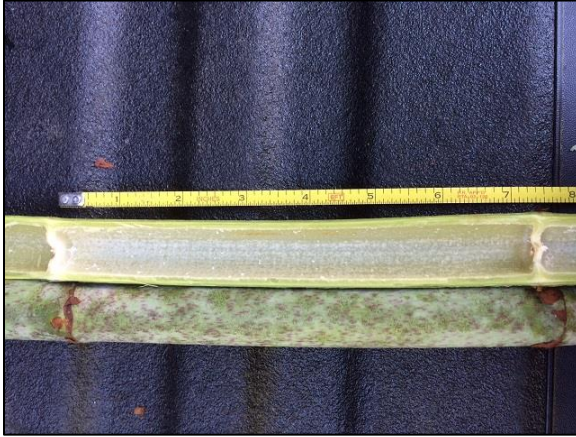
Stems are hollow and segmented with partitions