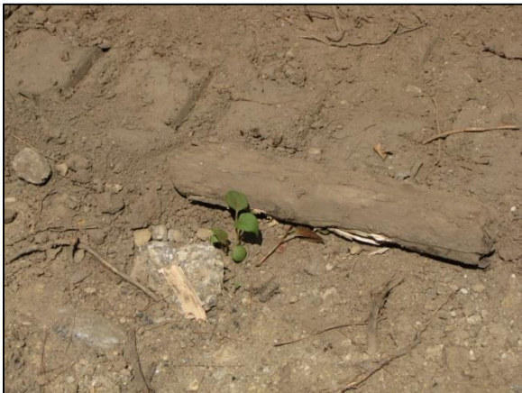
Accidental spread from rhizome fragments