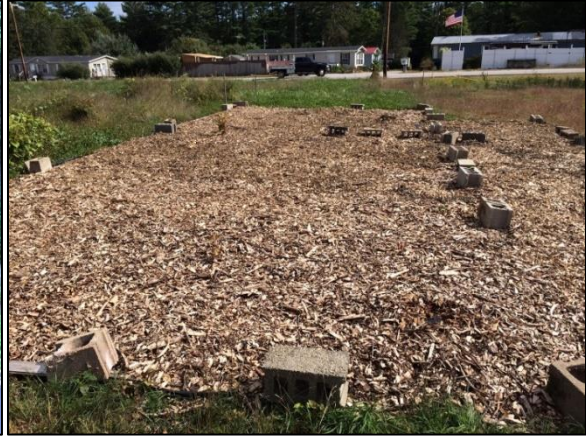
Smothering using 7-mil black plastic and 4" mulch