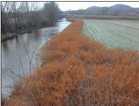
River embankment/floodplain/farm field impacts