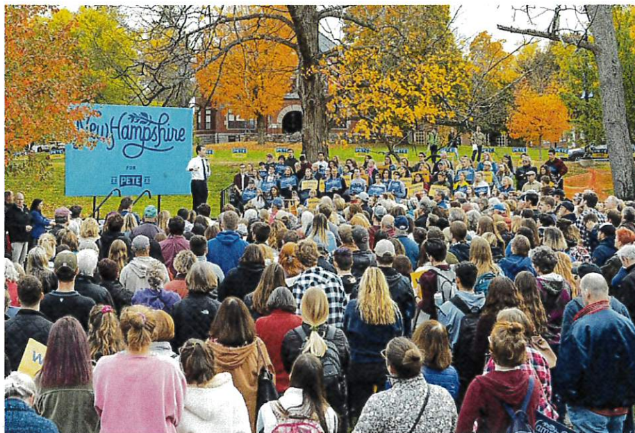
A town hall meeting in Durham, New Hampshire.

At its core, Durham is a place where people care. The community is known for being progressive, inclusive, and highly involved in local decision-making. Civic engagement is strong, with residents participating in town meetings, school board discussions, and sustainability initiatives. Newcomers consistently find Durham to be a welcoming place where they can easily get involved, meet neighbors, and become part of the fabric of the city. Whether raising a family, launching a business, or settling into retirement, Durham supports an engaged, thoughtful way of life.