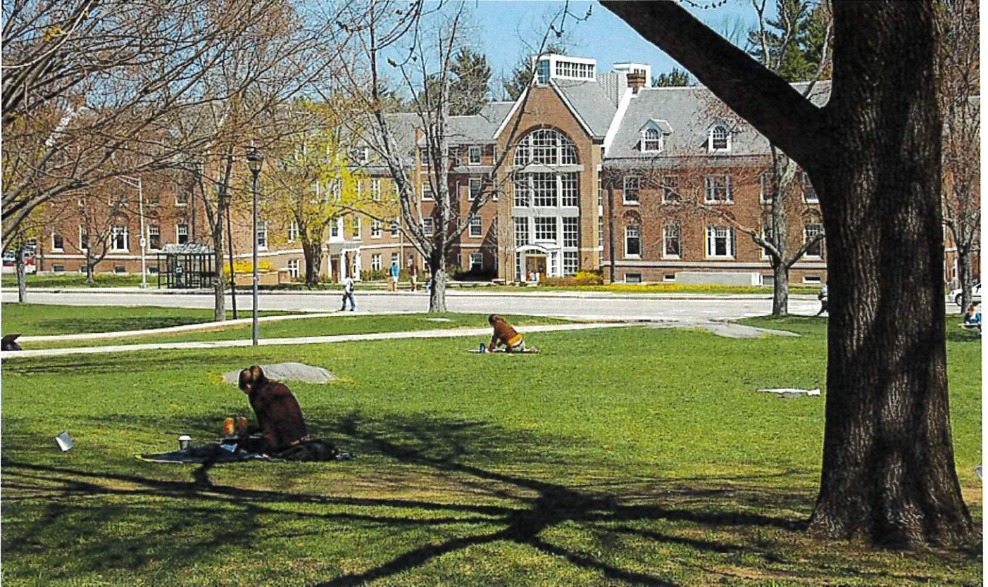
Congreve Hall on the University of New Hampshire campus in Durham, New Hampshire.

The University of New Hampshire, founded in 1866, has grown into the state's flagship public research institution. Its influence reaches far beyond the student population. It supports local businesses, fosters innovation, and brings in talent from around the globe . The partnership between Durham and the university continues to evolve, creating a relationship where education, research, and community development are deeply intertwined.