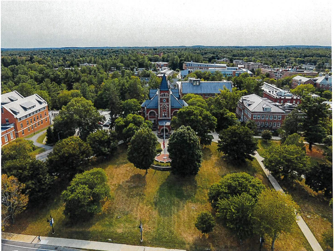
Aerial view of the University of New Hampshire in Durham, New Hampshire.

Durham's story begins centuries ago, with its earliest colonial settlements tracing back to the 1600s. Incorporated in 1732, the town has always maintained a strong connection to its heritage, visible in its preserved architecture, historic homes, and charming downtown layout. While the town honors its roots, Durham also represents a community that is forward-thinking and open to growth. At the heart of this evolution is the University of New Hampshire , an institution that not only anchors the city academically and culturally but also serves as a major driver of its economy and development.