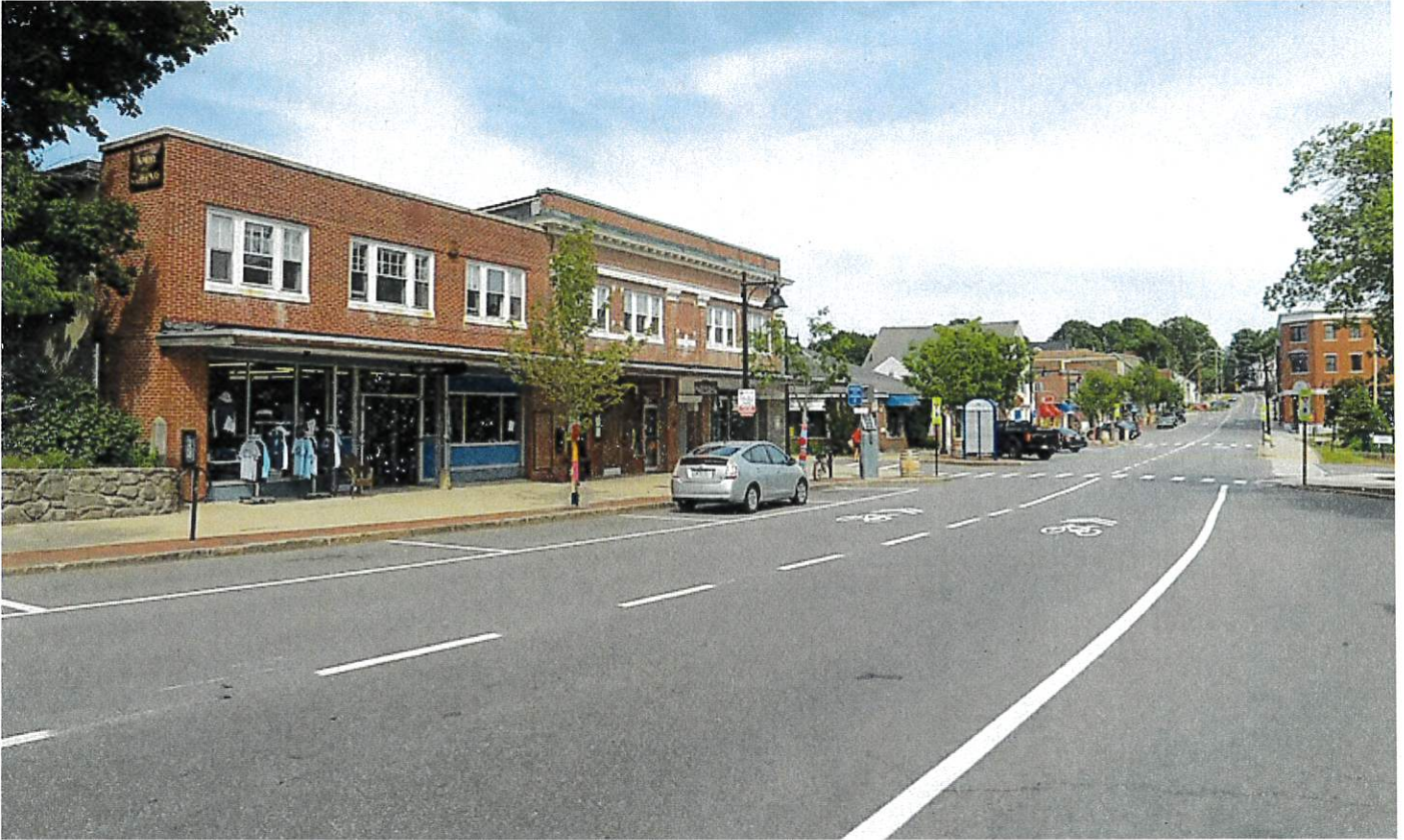
Main Street in Durham, New Hampshire.

While it may be best known for academics and nature, Durham also boasts a lively cultural and tourism scene that's grown significantly over the past decade. Much of this vibrancy comes from the University of New Hampshire, which hosts a variety of artistic and athletic events throughout the year. The Paul Creative Arts Center presents plays, musical performances, and public lectures, while the Whittemore Center Arena regularly fills with fans for hockey games, concerts, and major gatherings.