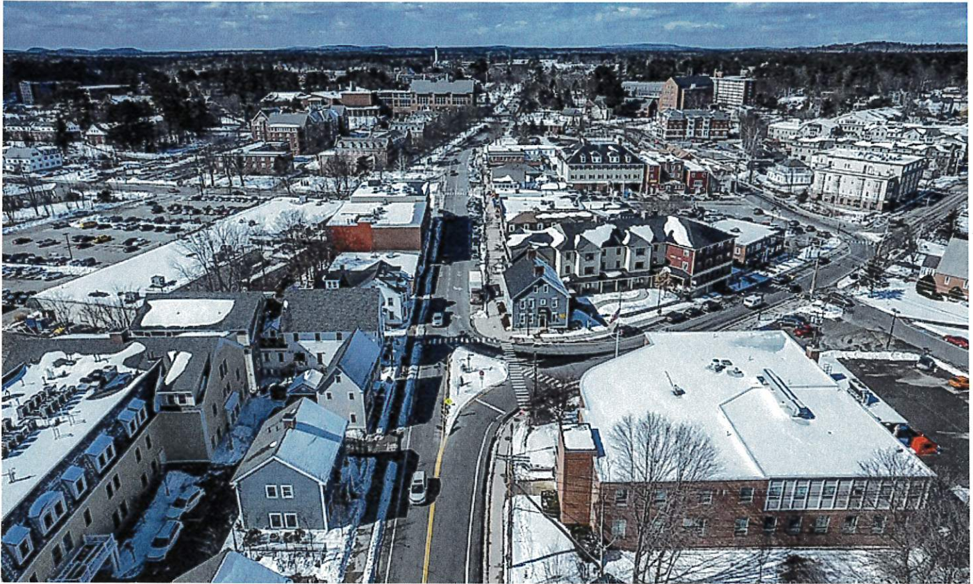
Aerial view of Durham, New Hampshire, in winter.

Throughout the year, events such as Durham Day, holiday parades, and university festivals provide entertainment and bring the community together. These cultural offerings, combined with its natural beauty and welcoming spirit, make Durham an increasingly popular destination for tourists and day-trippers exploring New Hampshire.