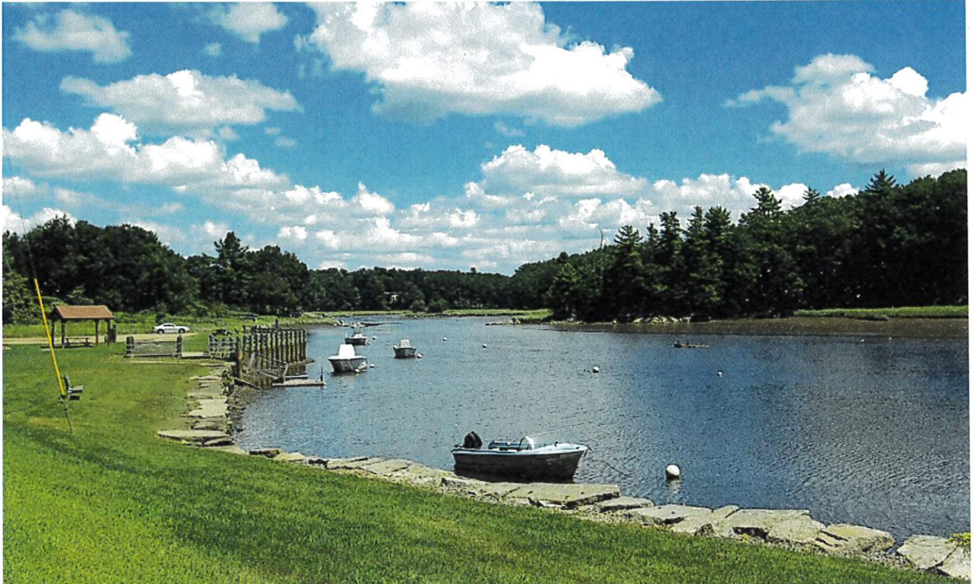
Scenic nature along the banks of Oyster River in Durham, New Hampshire.

Durham's natural beauty is among its most compelling features. The city is perfectly positioned between New Hampshire's famous lakes region and its picturesque seacoast, making it a haven for outdoor enthusiasts. The nearby Great Bay Estuary offers breathtaking views and biodiversity, ideal for birdwatching, kayaking, or simply soaking in the serene landscapes.