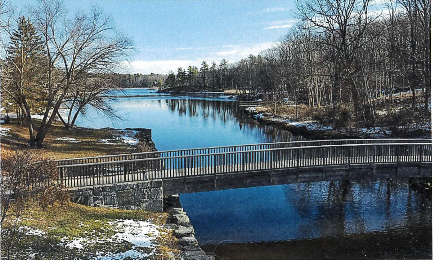
A bridge across the Oyster River in Durham, New Hampshire.

Just a short drive from downtown, residents can easily reach the Atlantic Ocean , with sandy beaches in Rye and Hampton providing ideal weekend escapes. Proximity to the White Mountains and Lake Winnepesaukee further extends the range of recreational possibilities. Whether hiking, skiing, boating, or camping, Durham places all of New Hampshire's outdoor attractions within easy reach.