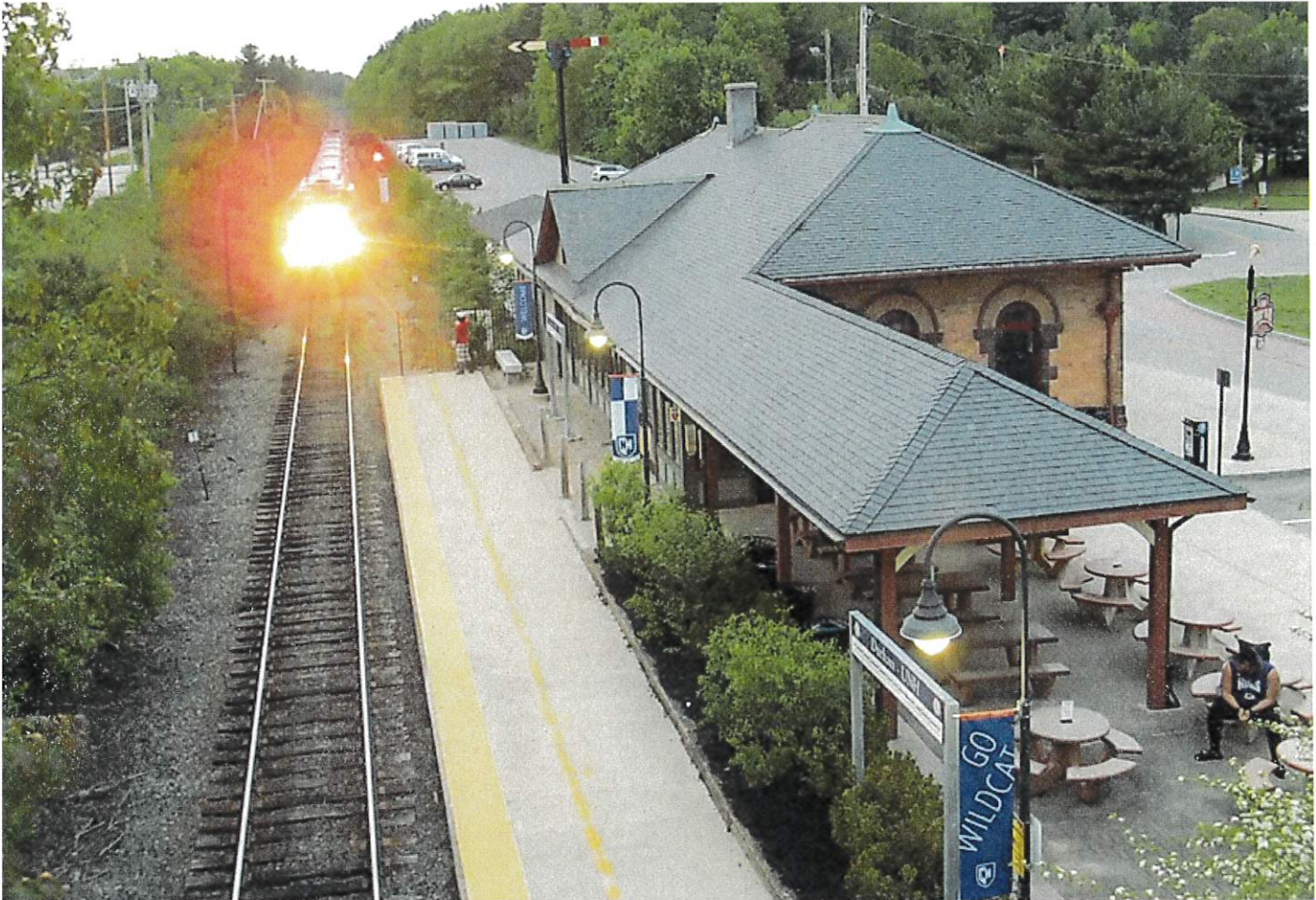
The train station in Durham, New Hampshire.

One of Durham's greatest advantages is its accessibility. Located less than 15 minutes from Portsmouth and about an hour from Boston, Durham offers the charm and affordability of small-town living with the conveniences of major urban centers. The city is served by the Amtrak Downeaster train, which runs directly from Durham to both Boston and Portland, Maine , making it a convenient option for commuters, students, and weekend travelers.