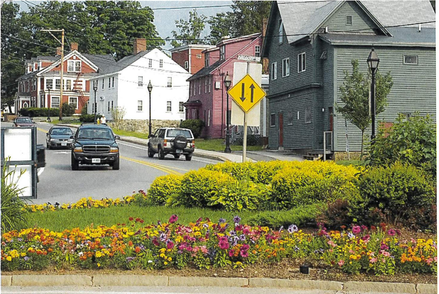
Beautiful homes in Durham, New Hampshire.

As housing costs surge in nearby cities such as Portsmouth and Boston , Durham has become a standout choice for those seeking a more affordable yet high-quality lifestyle. The city offers a well-rounded selection of housing, including newer developments, renovated colonial homes, and charming neighborhoods that provide walkability and a strong sense of community.