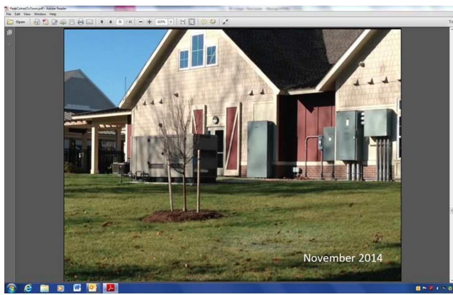
The Lodges – Amendment for utilities - May 13, 2015