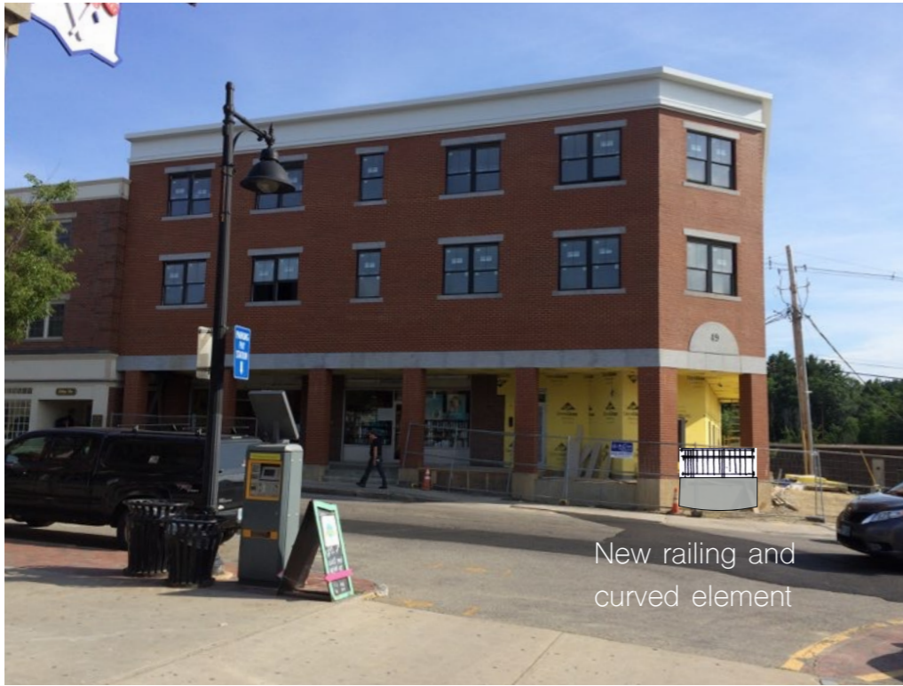
Revised Design Concept showing no steps