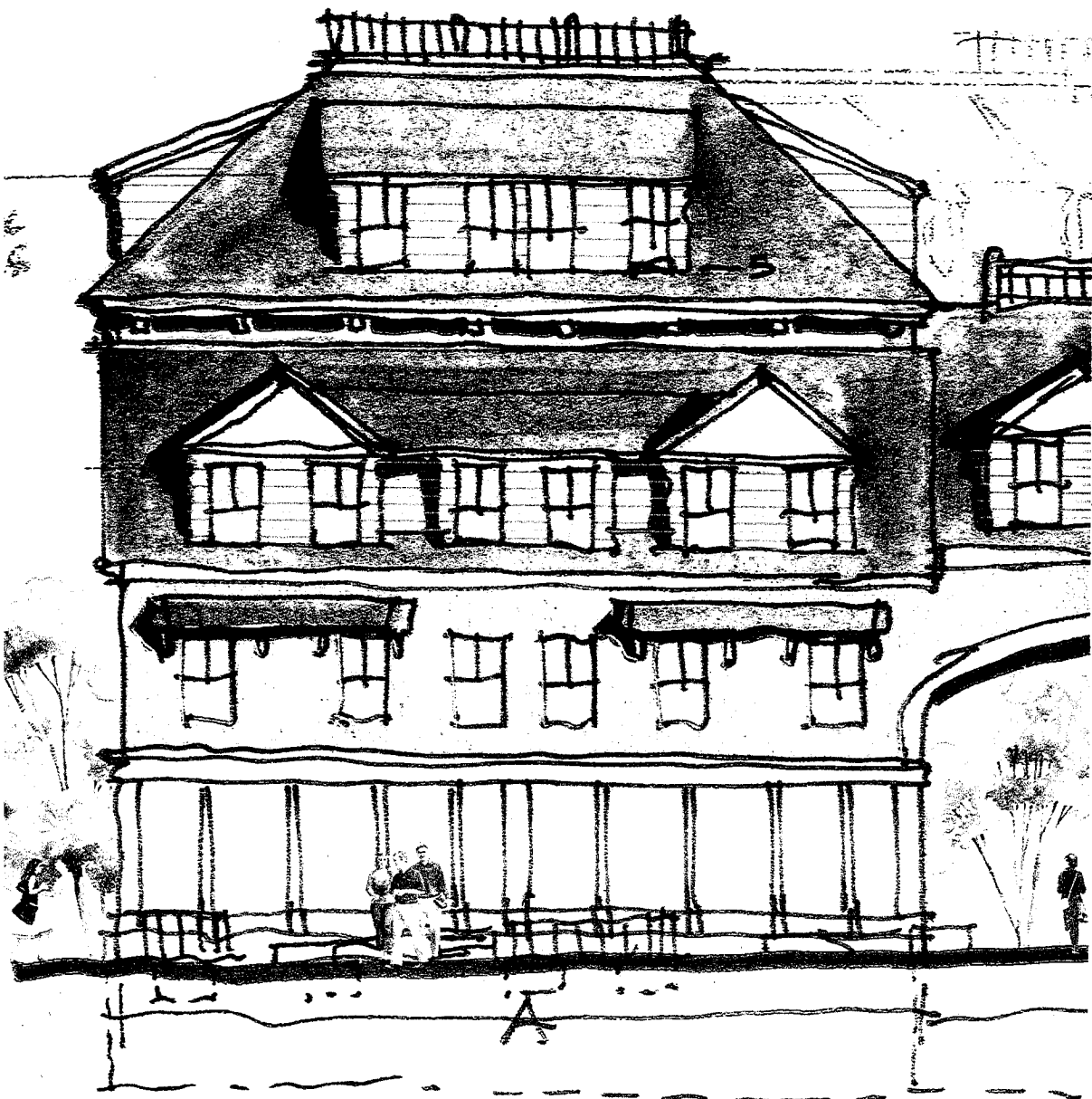
PARTIAL ELEVATION (MATERIALS AND MASSING)