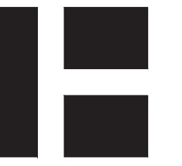
Diagram of Implications of Increasing the Width of the Medians from Six Feet to Ten Feet Prepared for the Town of Durham Planning Board Prepared by Harriman on behalf of Colonial Durham June 17, 2020

HARRIMAN AUBURN PORTLAND PORTSMOUTH BOSTON