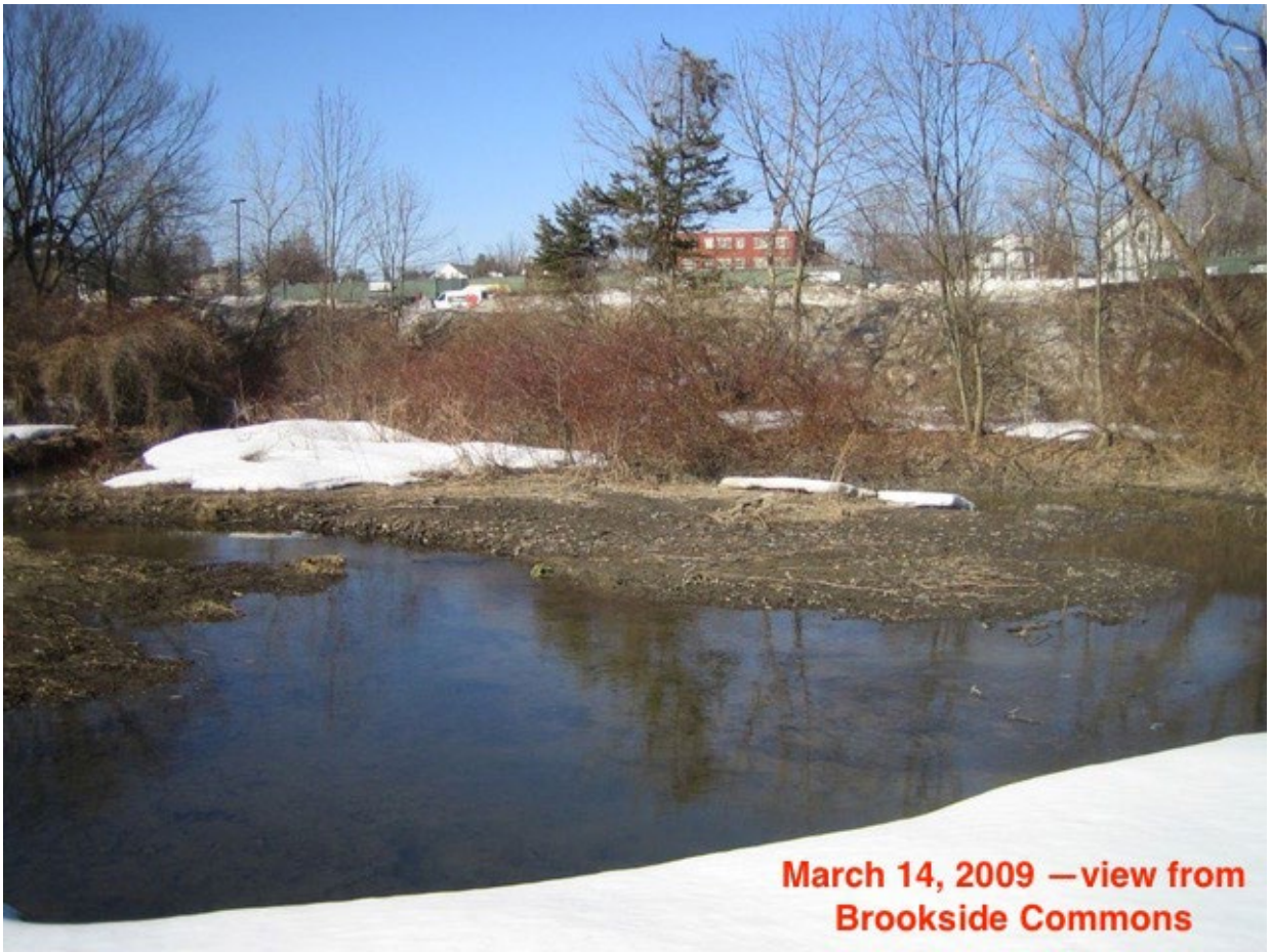
March 14, 2009 —view from Brookside Commons