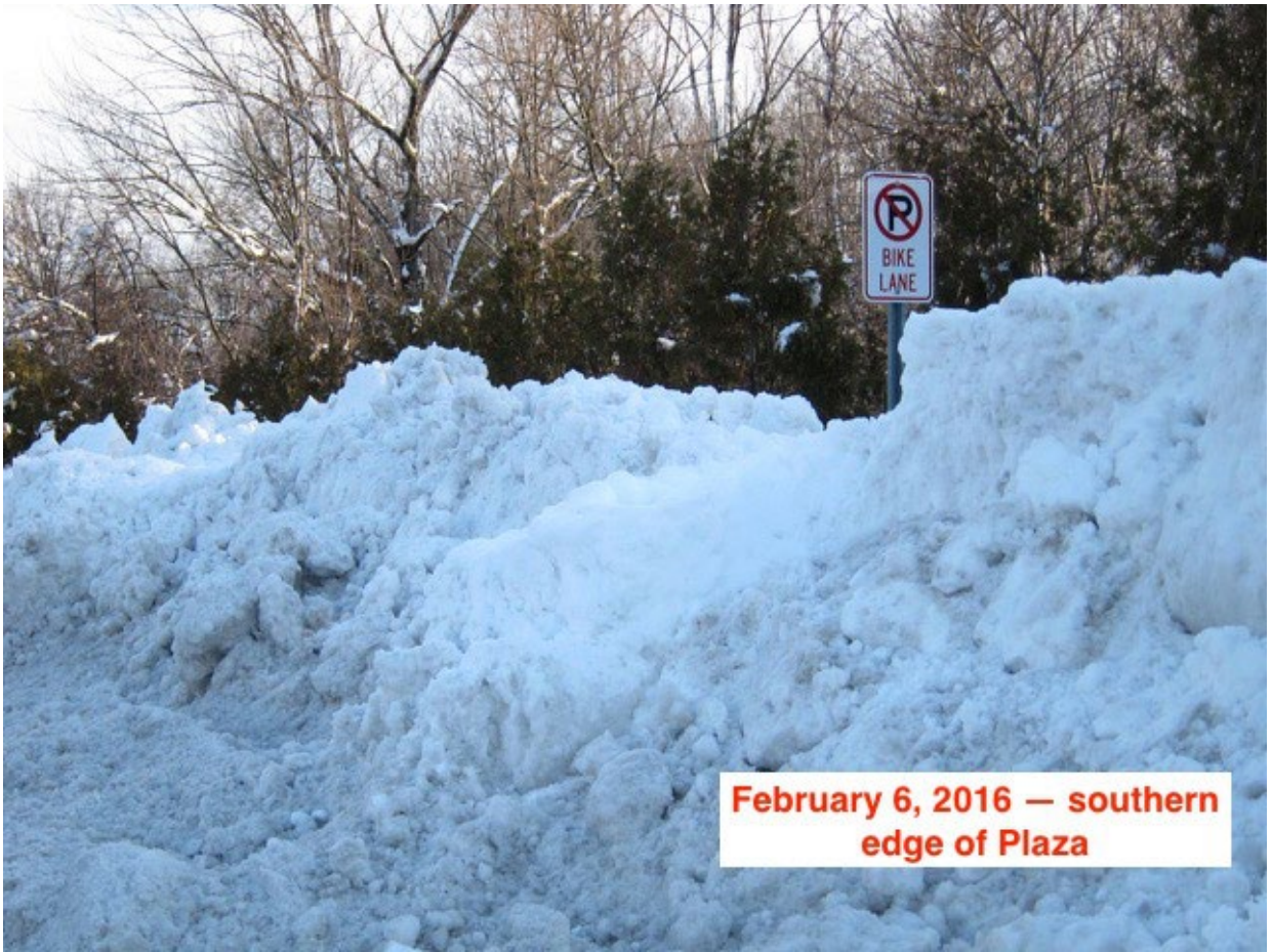
February 6, 2016 — southern edge of Plaza