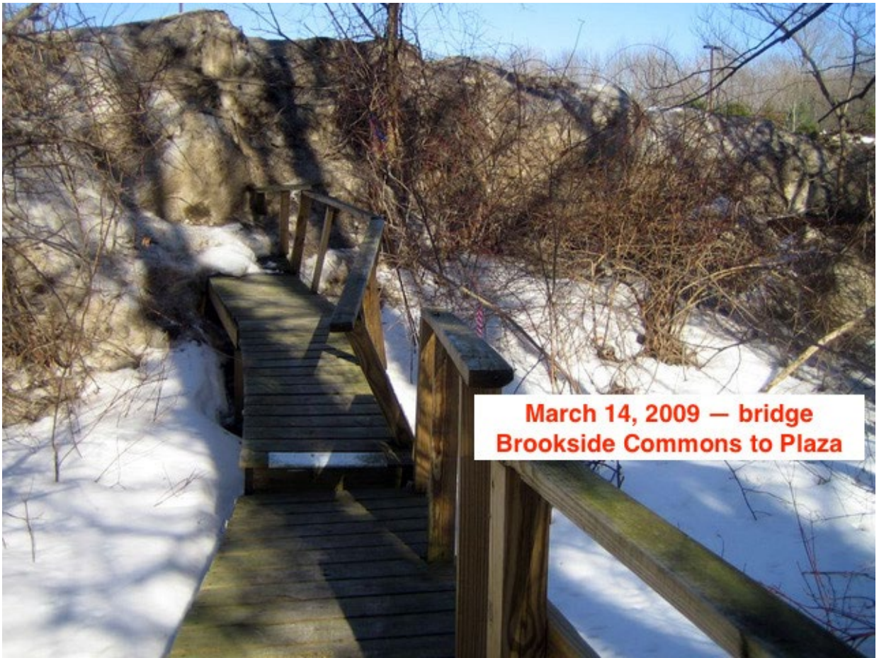
March 14, 2009 — bridge Brookside Commons to Plaza