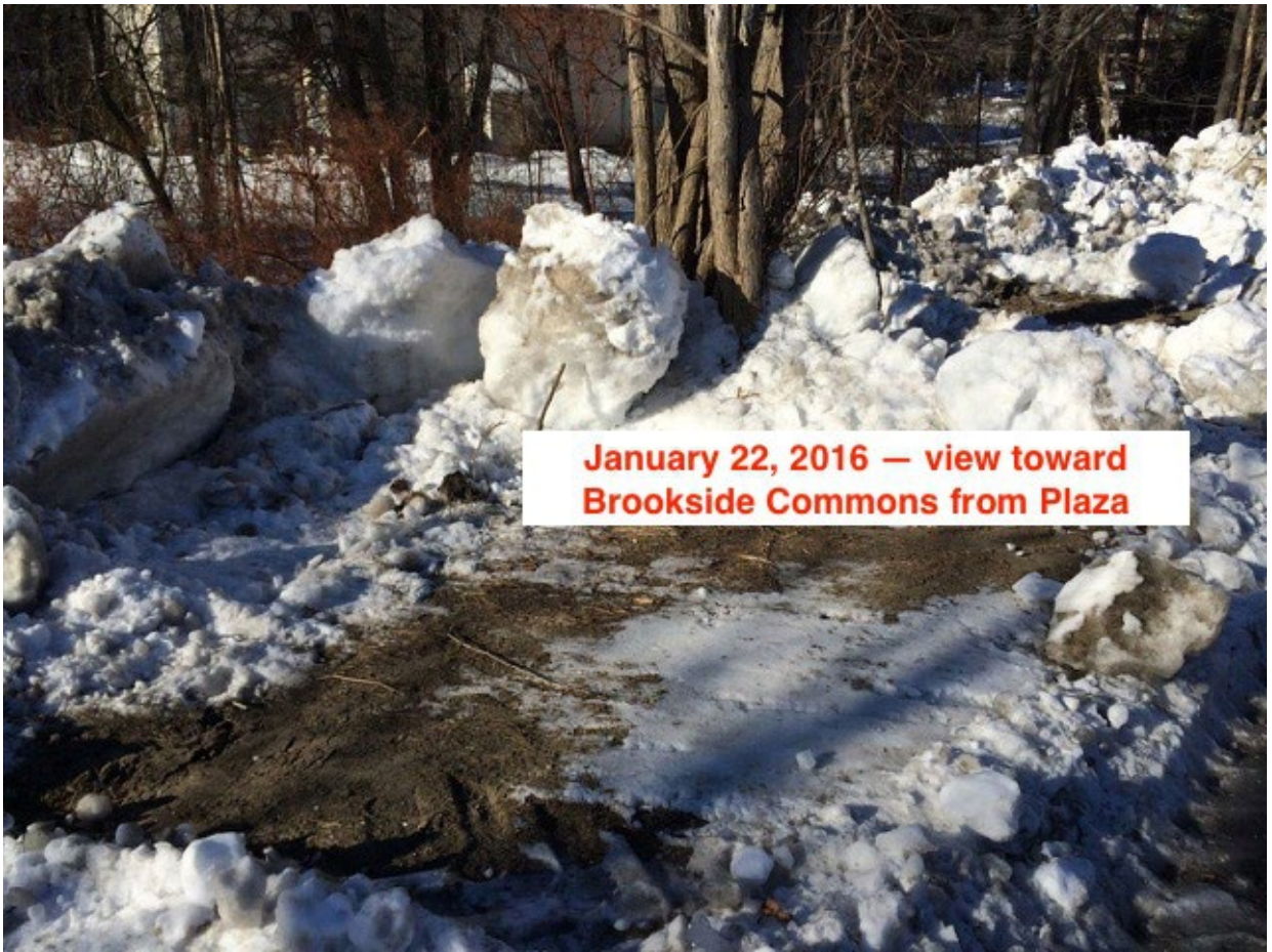
January 22, 2016 — view toward Brookside Commons from Plaza