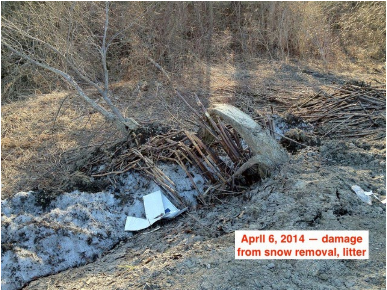
April 6, 2014 — damage from snow removal, litter