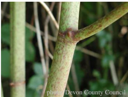
Close-up of stem