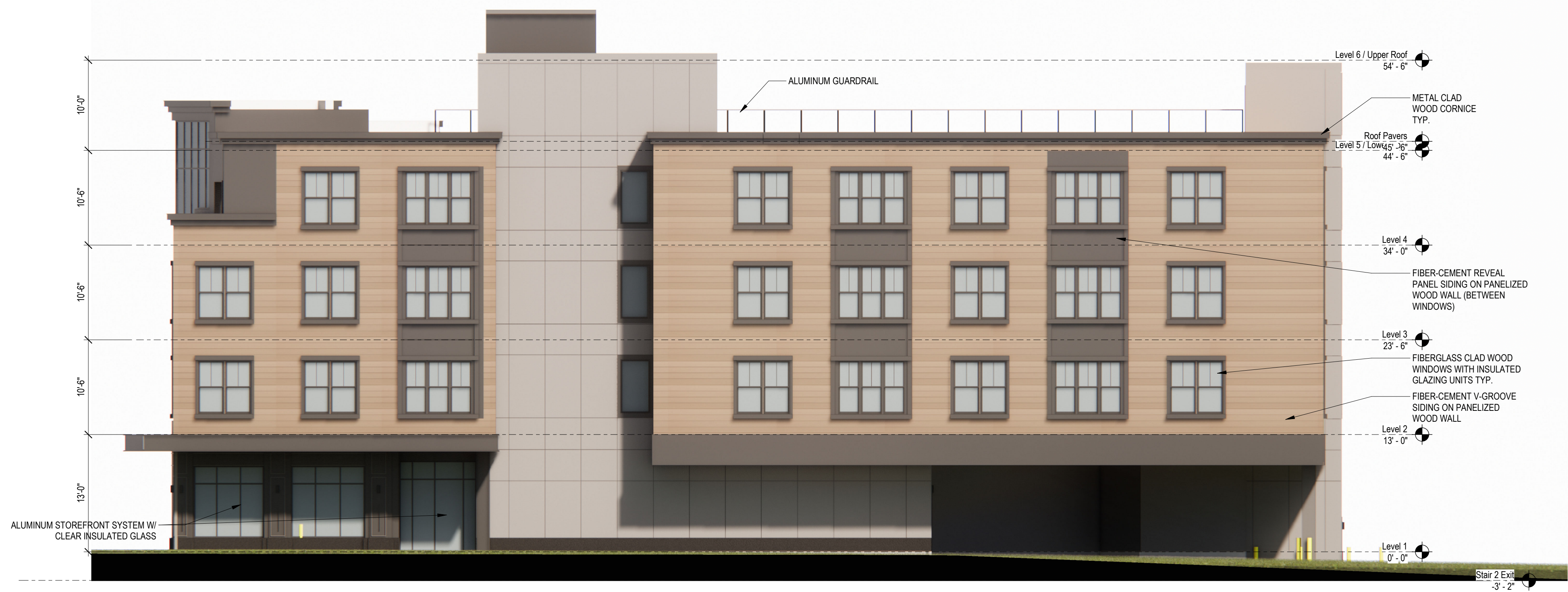
5 SOUTH ELEVATION (ALLEY) 1/8" = 1'-0"

8/3/2022 4:24:46 PM C:\Users\aligan\Documents\374-MAIN-ST_2022_RVT20-CENTRAL_detailed_0718.dwg\A201.rvt