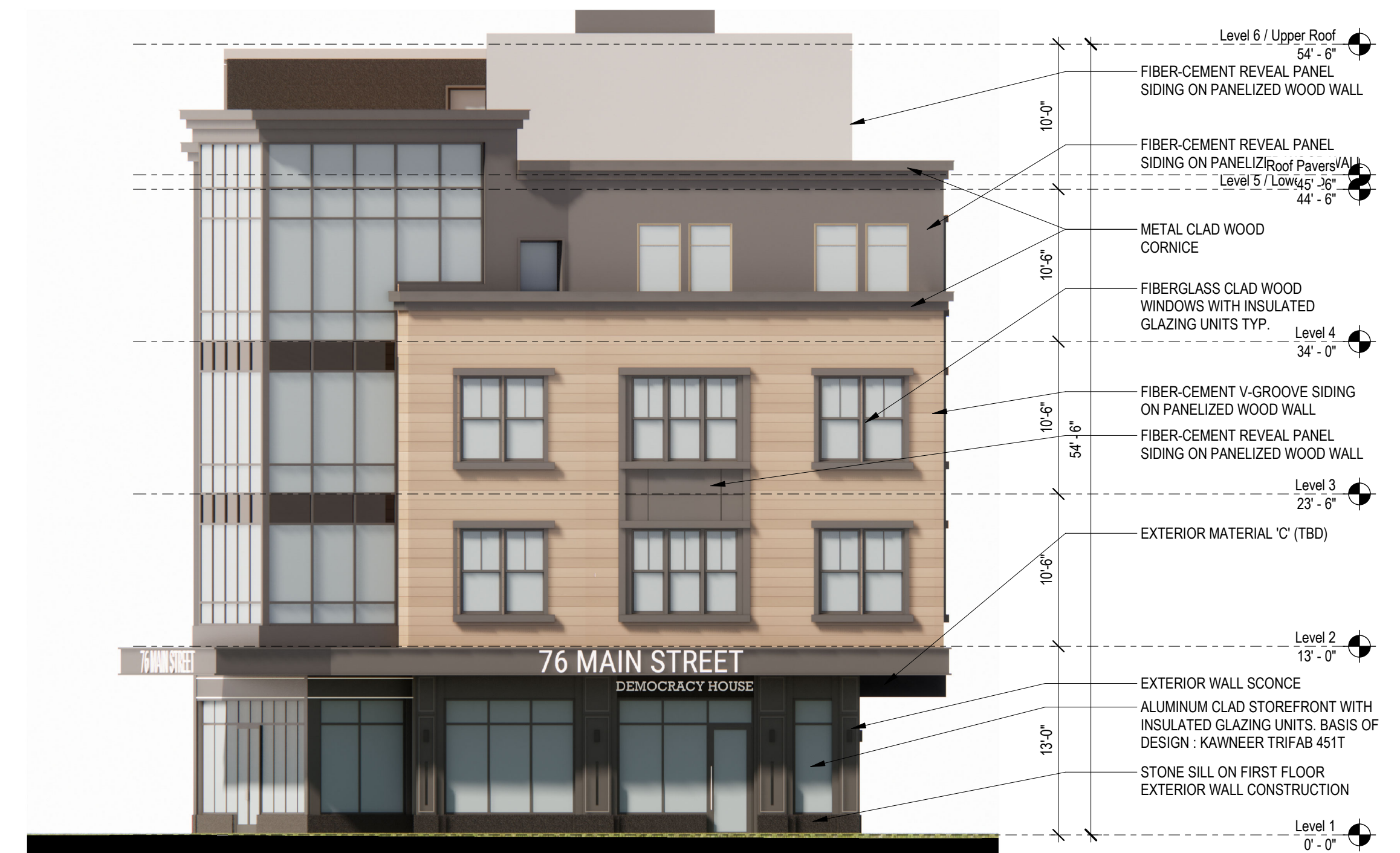
1 WEST ELEVATION (MAIN ST) 1/8" = 1'-0"