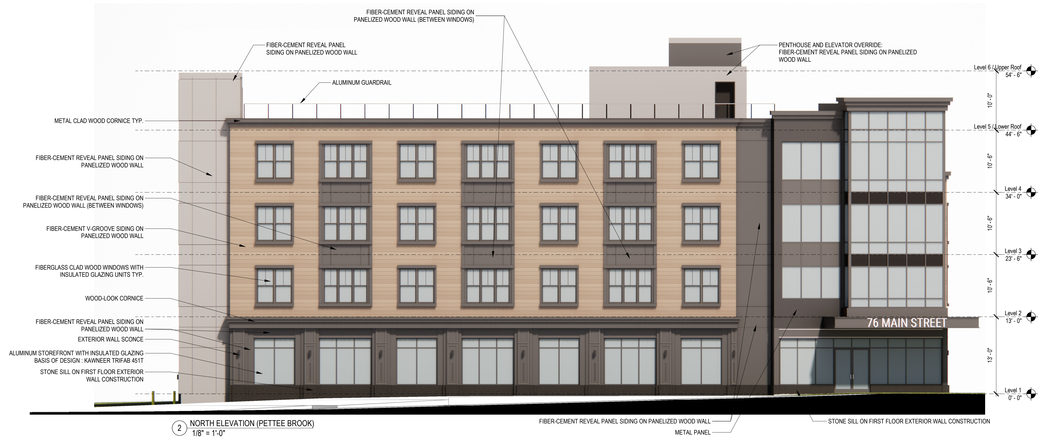
2 NORTH ELEVATION (PETTEE BROOK) 1/8" = 1'-0"