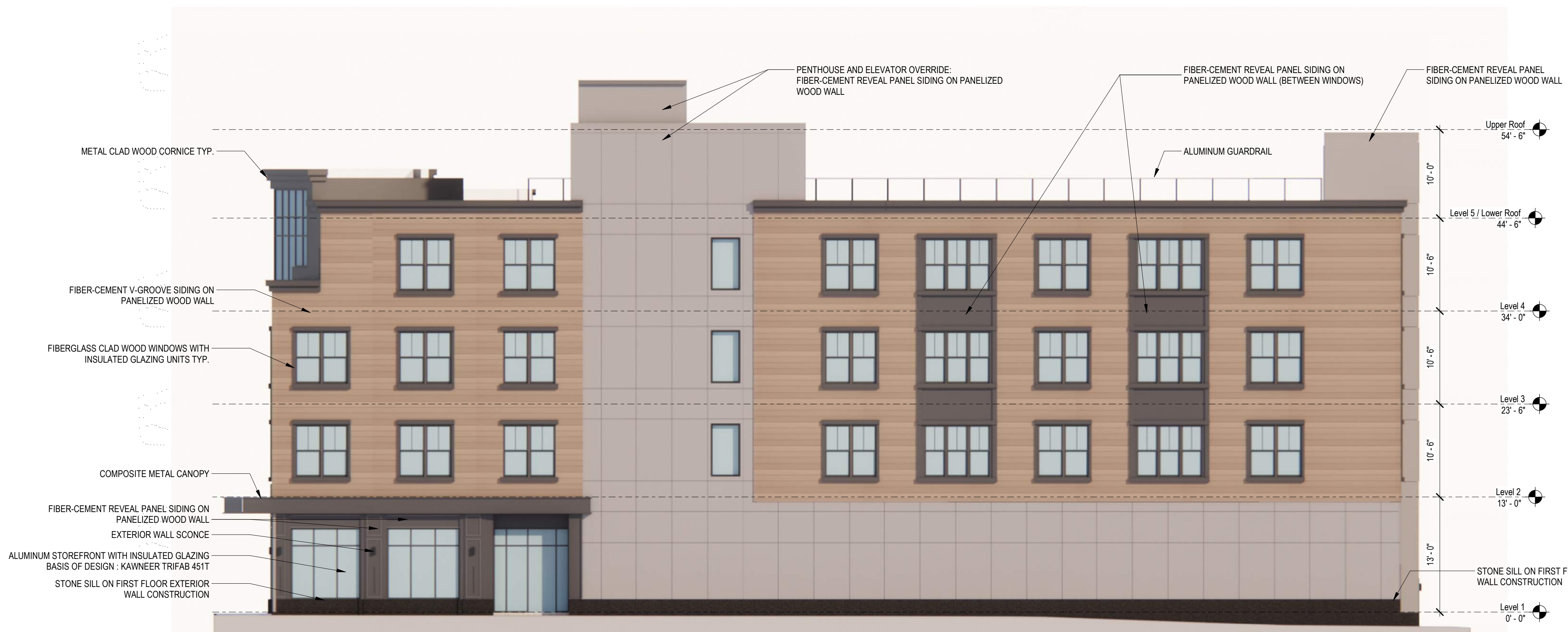
4 SOUTH (ALLEY) ELEVATION 1/8" = 1'-0"

4/26/2023 10:58:48 AM C:\job\15051-1001\15096.00\Production\BIM\Drawings\74-MAIN-ST_2023_ARCH-BERG_BY720_White_BA1_detached.dwg