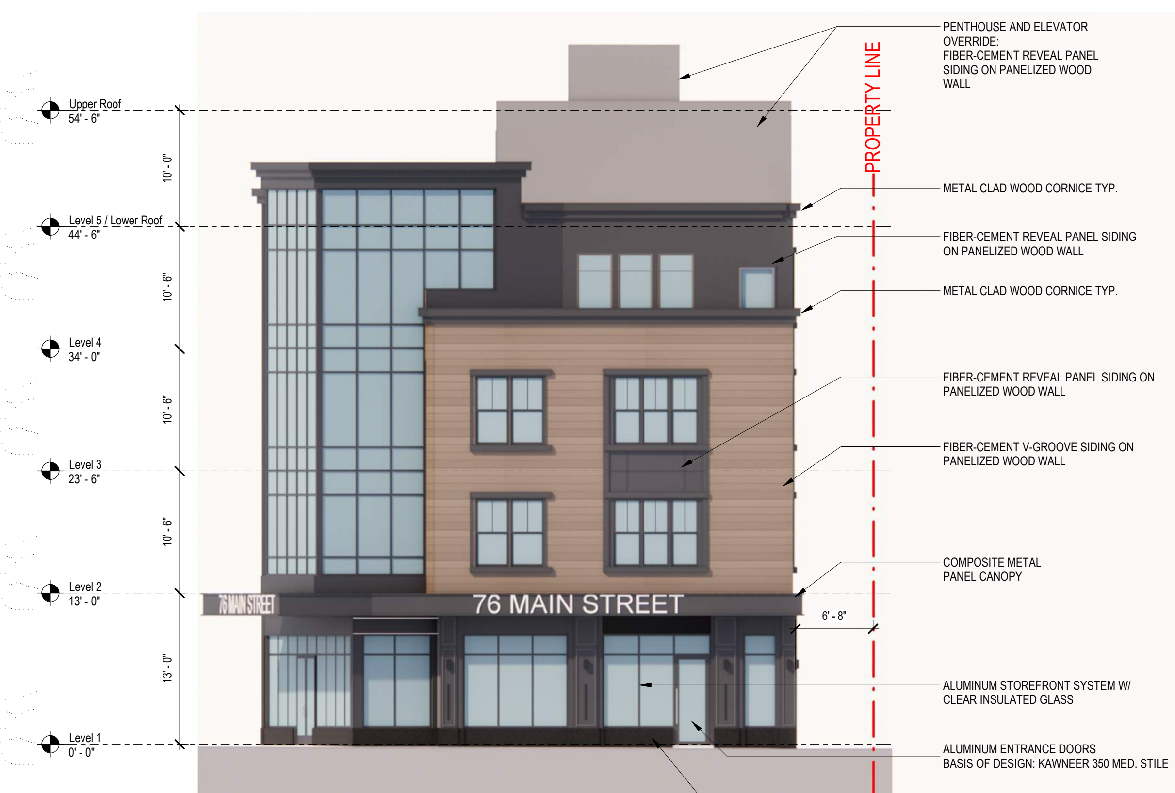
5 WEST (MAIN ST.) ELEVATION 1/8" = 1'-0"