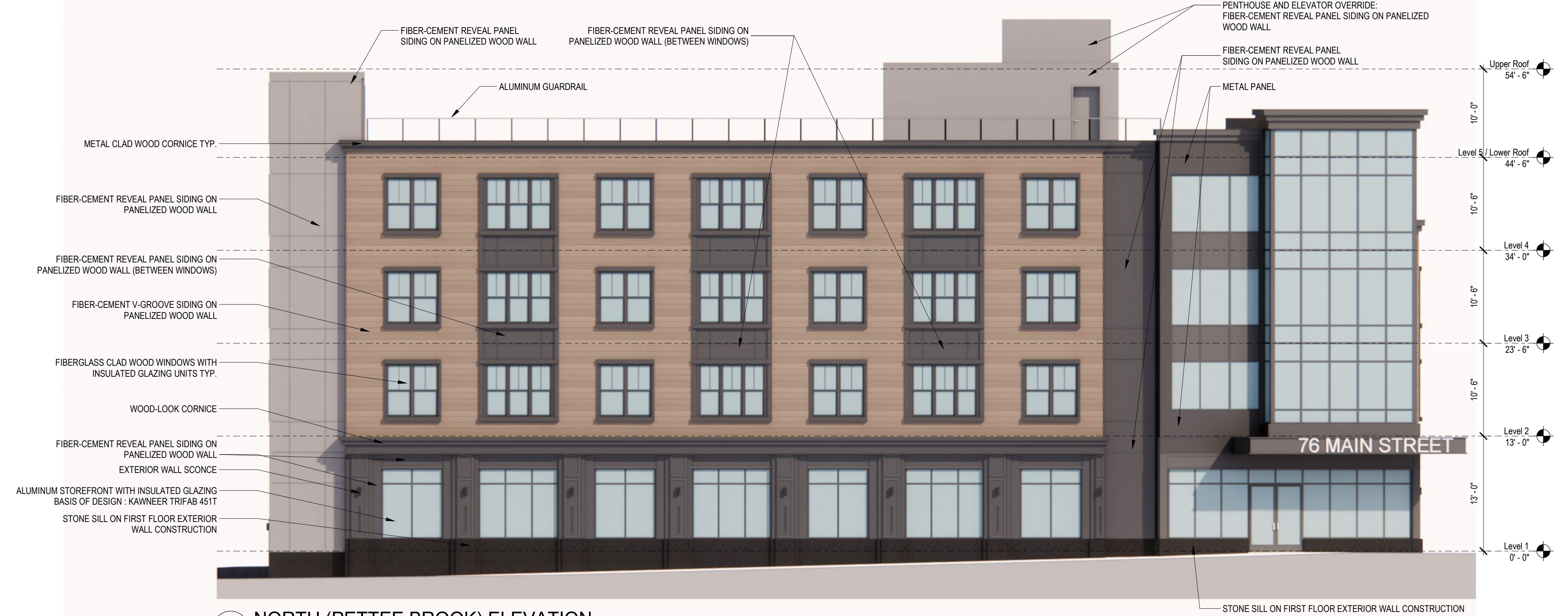
2 NORTH (PETTEE BROOK) ELEVATION 1/8" = 1'-0"