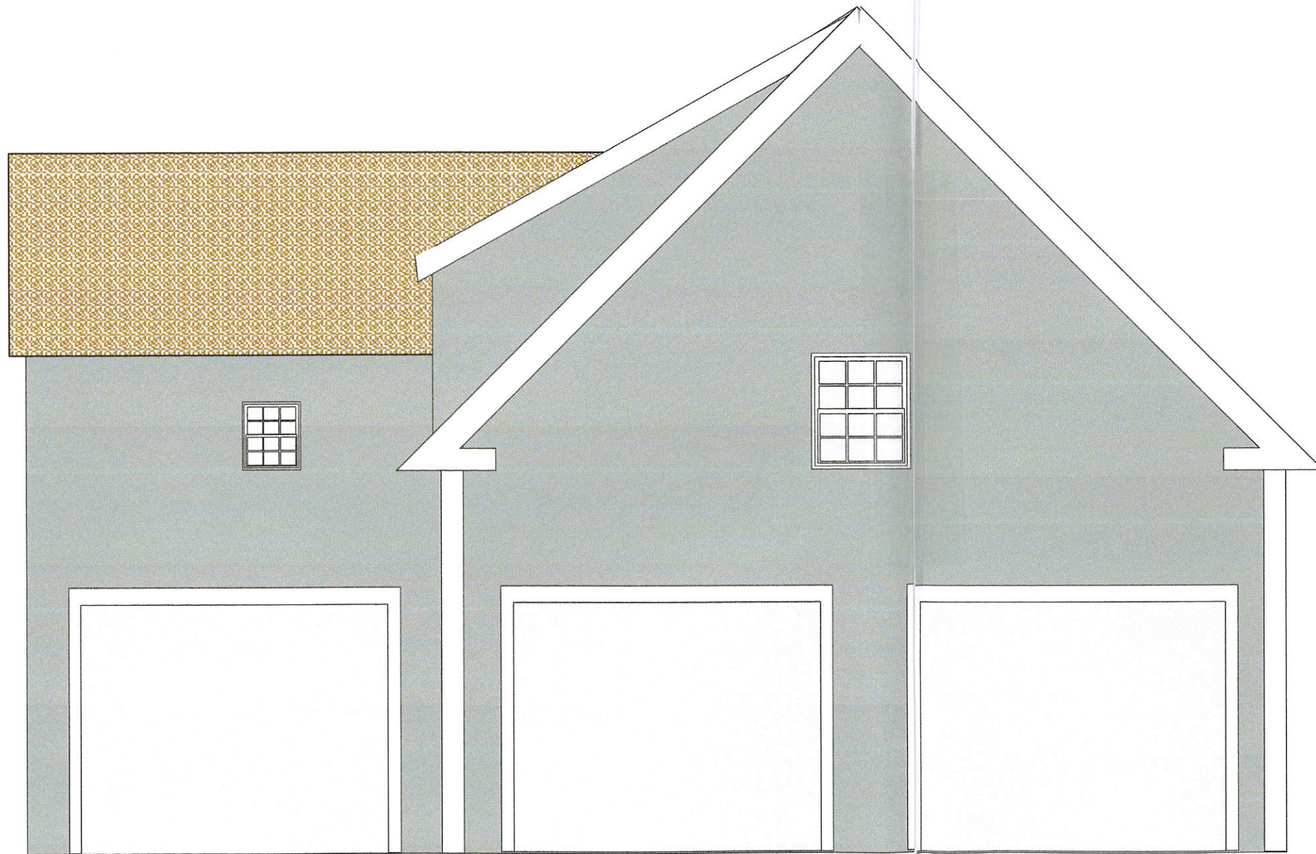
3 Elevation @ Garage Entry A1 Scale: 1/4" = 1'-0"