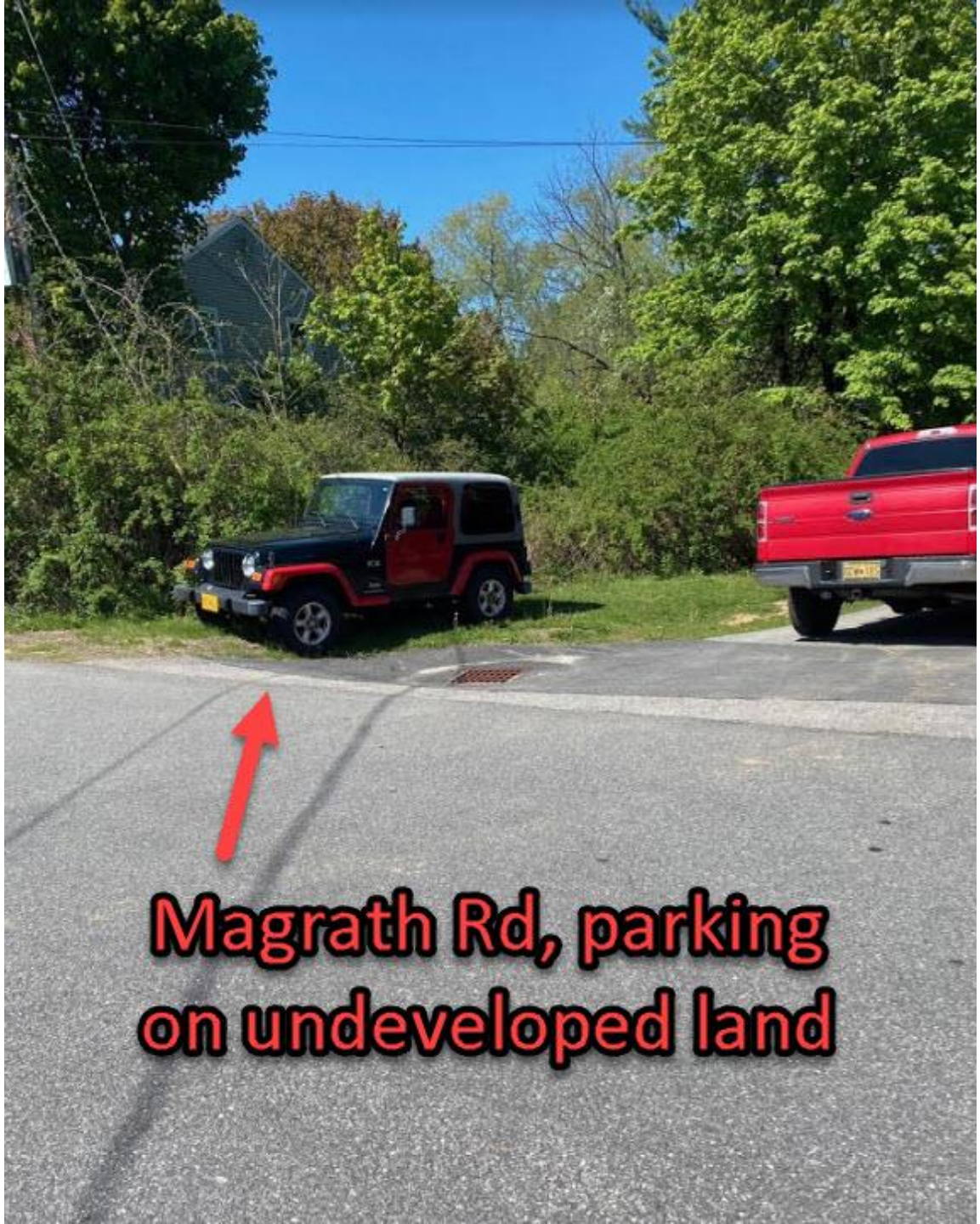
Magrath Rd, parking on undeveloped land