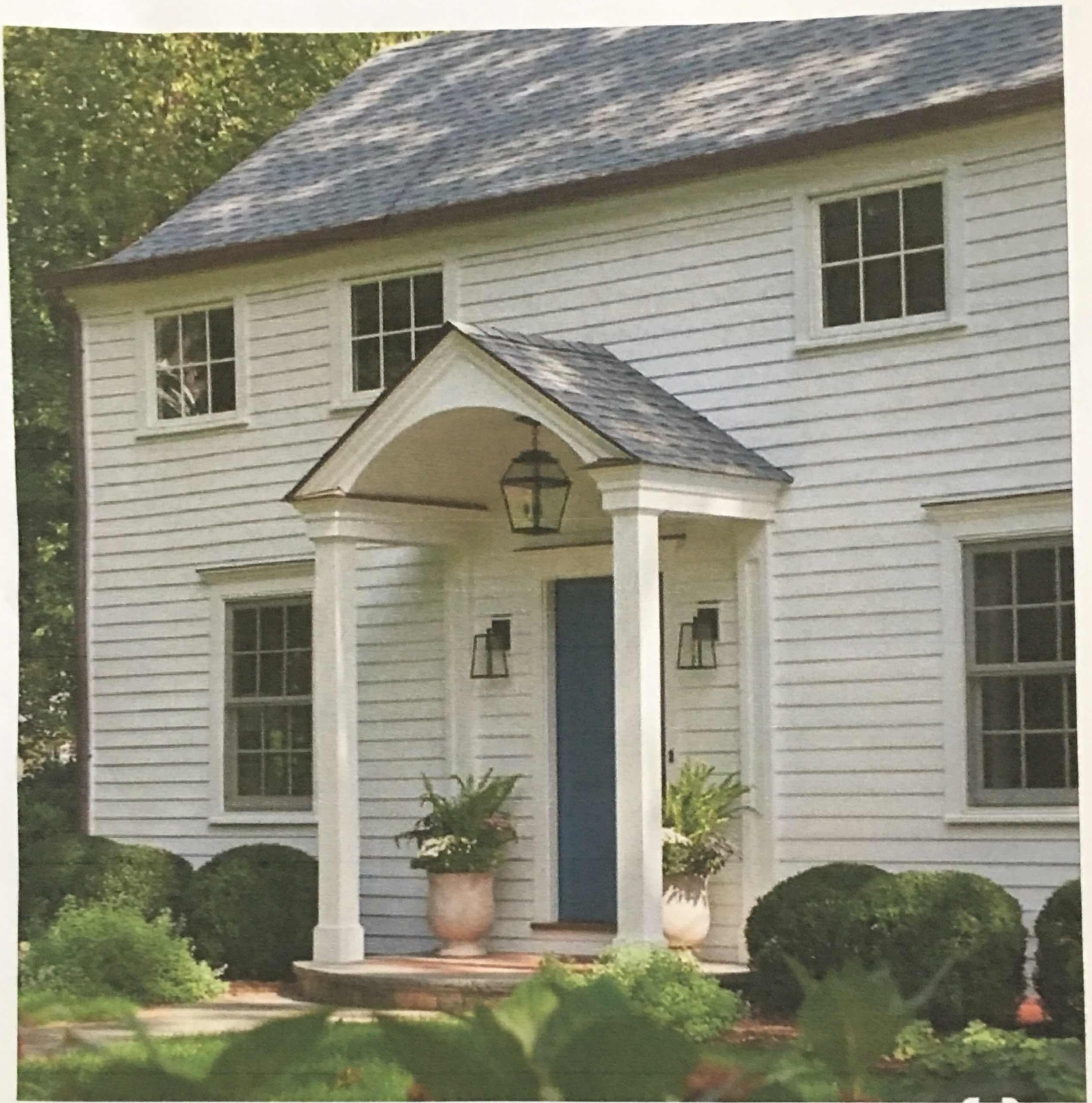
Proposed front porch example.